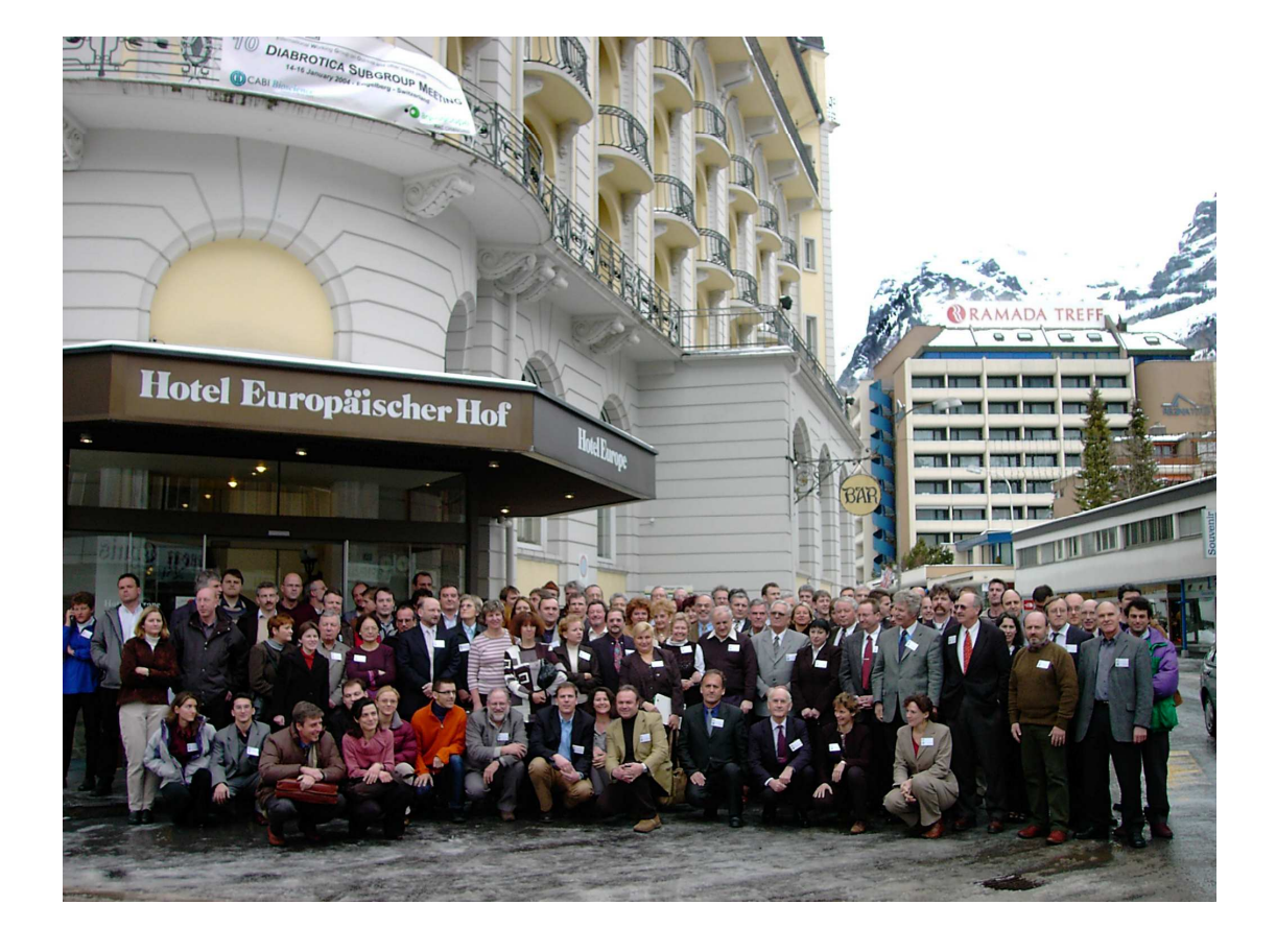
The IWGO – Group in front of the hotel and meeting place of the Xth Diabrotica -Subgroup Meeting in Engelberg, Switzerland