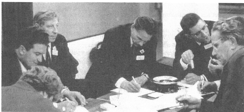
Figure 1. Founders of the IWGO working group in 1968

The International Working Group on Ostrinia (IWGO) is one of the oldest Working Groups within Global IOBC. The group was founded during the XIII th International Entomological Congress in Moscow in 1968, but its roots go back to the USA regional project on Ostrinia , which began in 1951. IWGO was established through this USA regional project. The founders of the group were D. Hadzistevic (Yugoslavia), whose original idea it was to establish a group for international cooperation, H.C. Chiang (USA), who brought ideas from the USA regional project to the group, I.D. Shapiro (USSR), T. Perju (Romania), C. Kania (Poland), B. Dolinka and B. Nagy (Hungary) (Figure 1). All were well known entomologists or maize breeders. The group was originally organized so that each member country had an official "member" representative and all other participants were classified as "associate members." Researchers who took part in meetings from time to time were called "guest members."